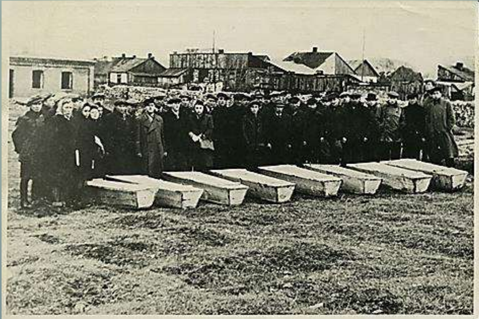
Kielce, Poland, 1946 The funeral of the pogrom's victims