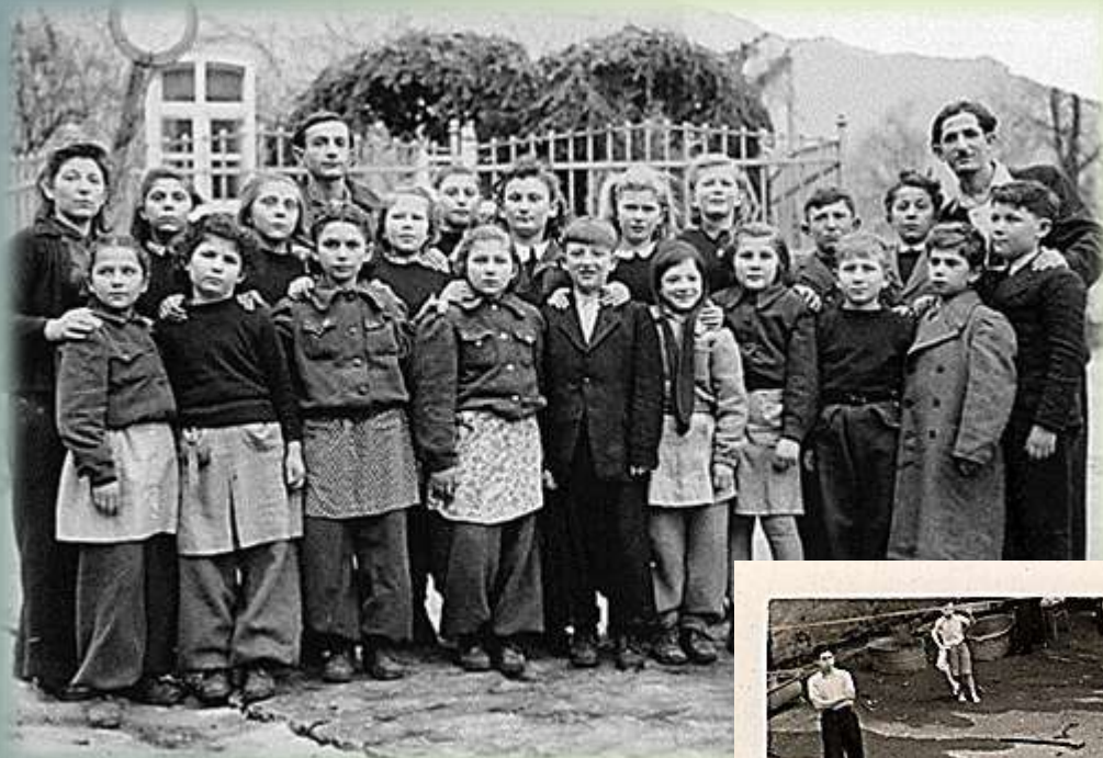
Schauenstein, Germany, 1946. A school for child survivors