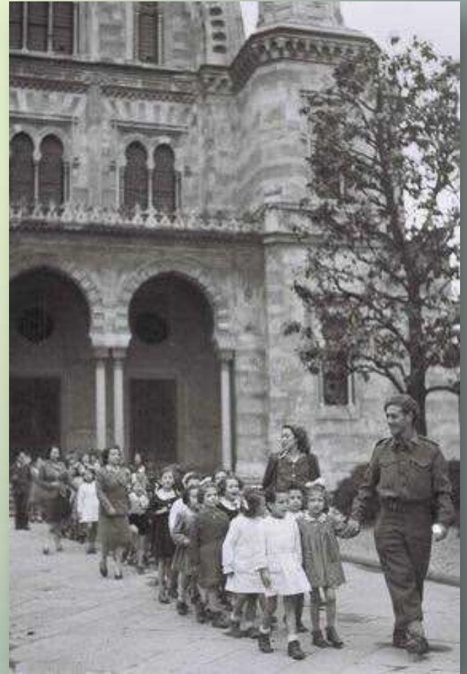
Florence, Italy. A jewish Brigade soldier leading a group of child refugees

Two years after the war's end, in July 1947, there are 30,000 children awaiting the journey to Eretz Yisrael. They are gathered in 130 children homes in 13 different countries, and there are many more uncounted for.