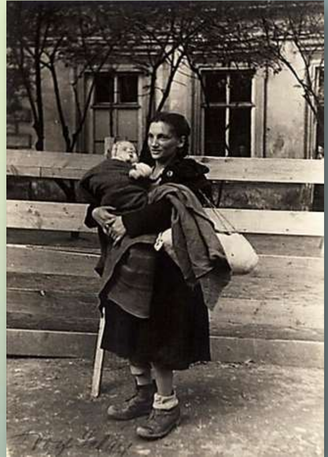
A mother carrying a baby at an unidentified gathering station

Ben Gurion is aware of the power inherent in the situation of the refugees, who "have no future anywhere but in the land of Israel" , for the recruiting of international support for Zionist aspirations. President Truman appoints a Joint Anglo-American Committee to initiate a viable solution for Jewish displaced persons.