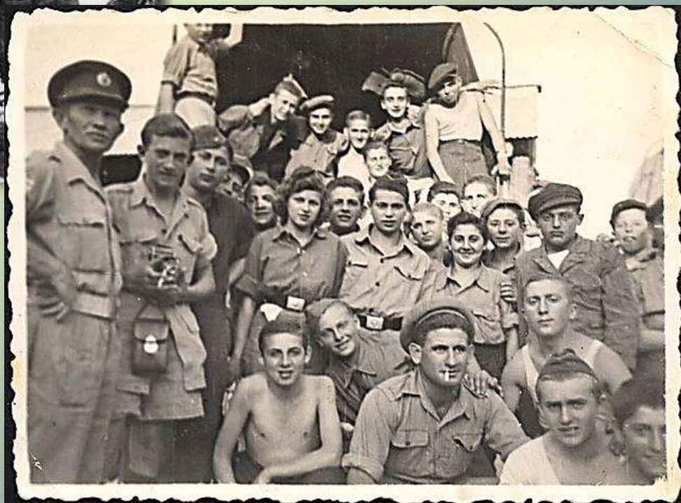
Jewish Brigade soldiers with young survivors