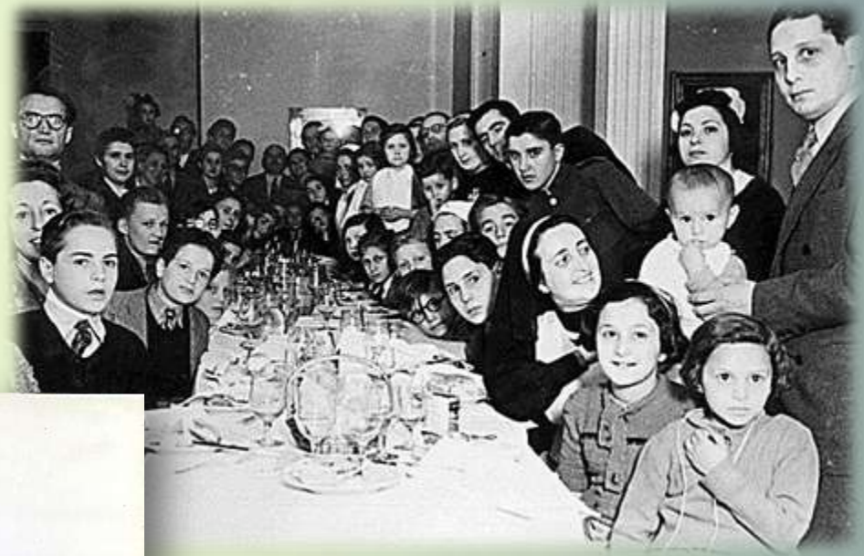
A party held by the JDC in a displaced persons camp