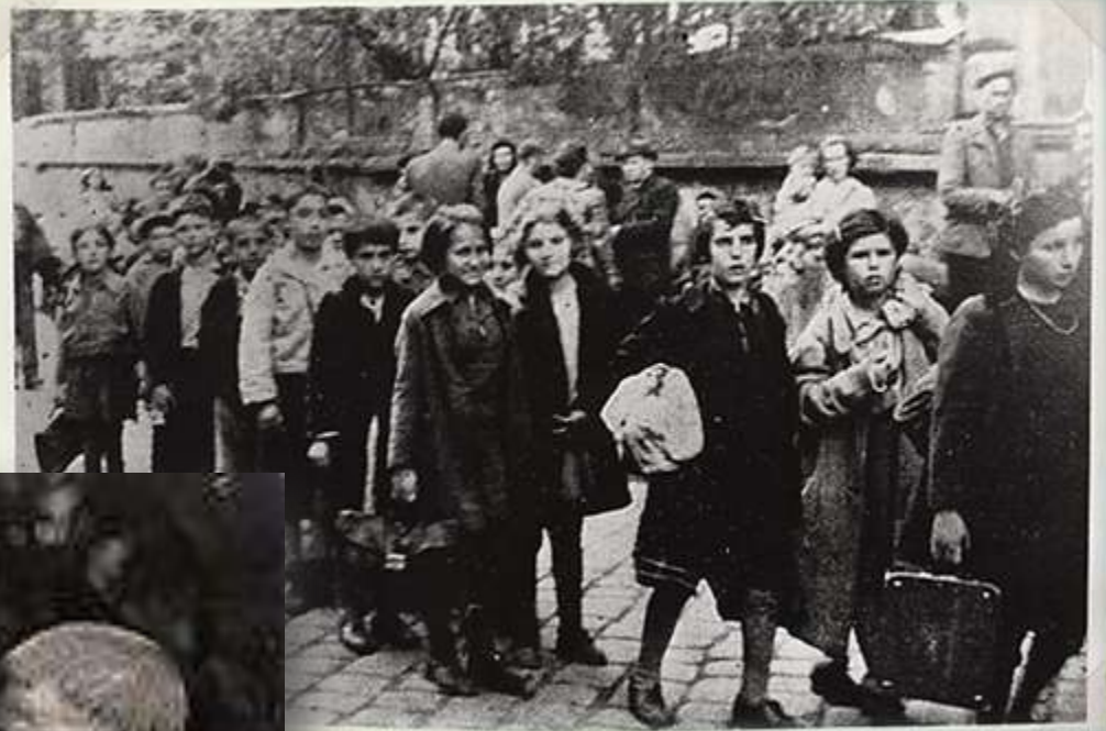
A group of child refugees on their way