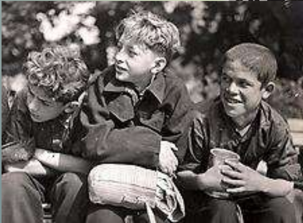
Child survivors from Poland, on their way to a displaced persons camp in the American occupied zone