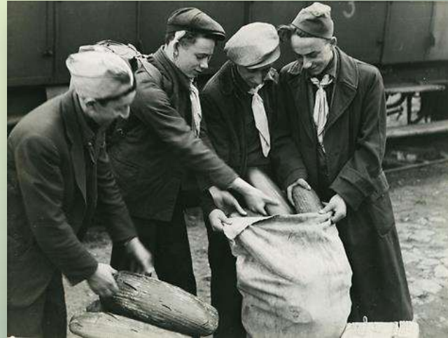
Youth movement activists preparing to serve bread

Many refugees are eager to establish a safe homeland in Eretz Yisrael. The activists start to seek a way to aid survivors escape from Europe.