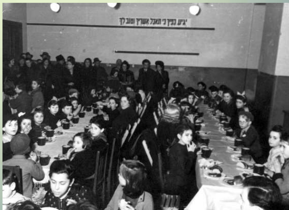
Vienna, Austria. Children dining in Rothschild DP Camp

The stay in the camp is long, the overcrowding is terrible and the uncertainty is enormous. Nevertheless the children are beginning to calm down. As there are no Polish people around, they take the crosses off their necks, start laughing and playing. The children's attendants create a warm and caring educational environment.