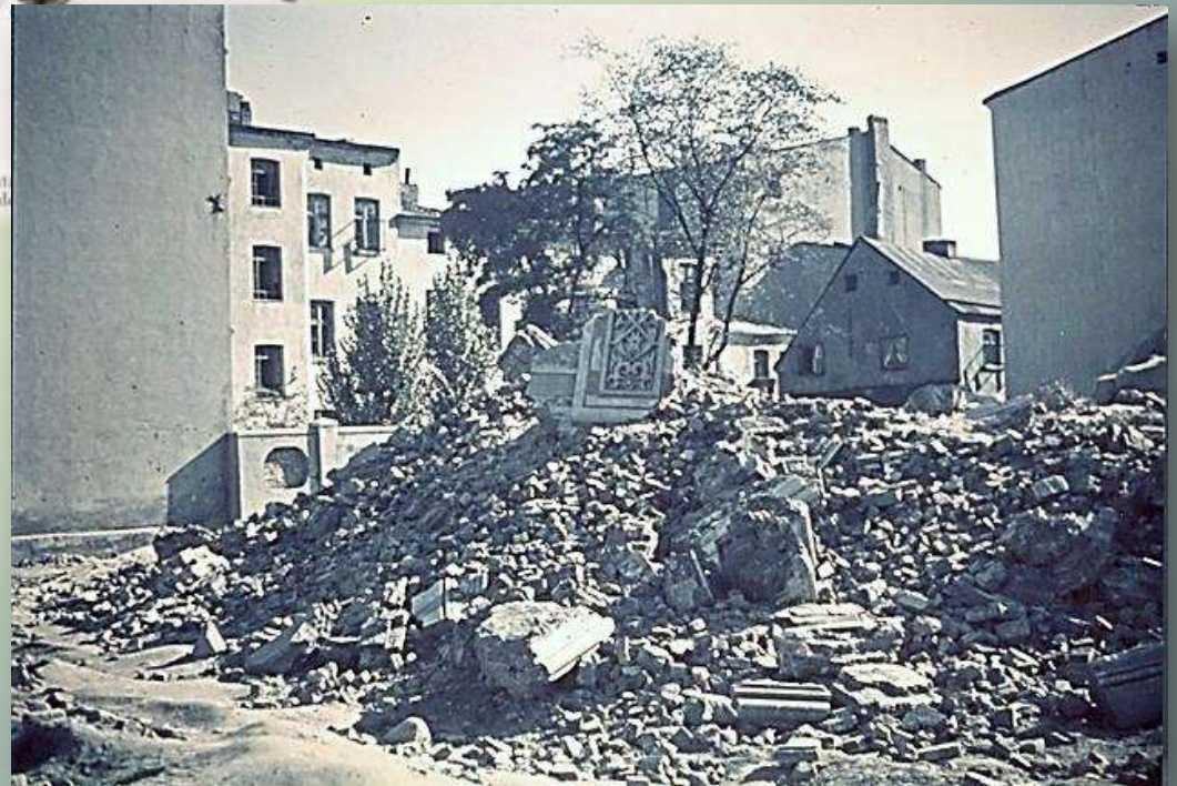
Lodge, Poland. The ruins of the Jewish Ghetto