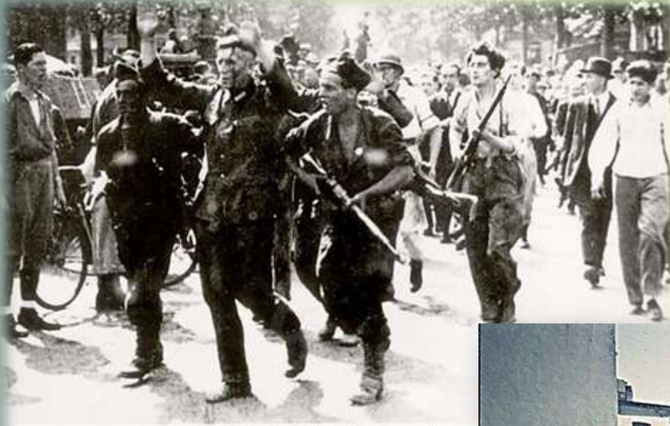
Paris nach der Übergabe: der lang unterdrückte Haß der Bevölkerung gegen das Besatzungsregime gegen die letzten deutschen Soldaten der Pariser Garnison, die der Résistance und d