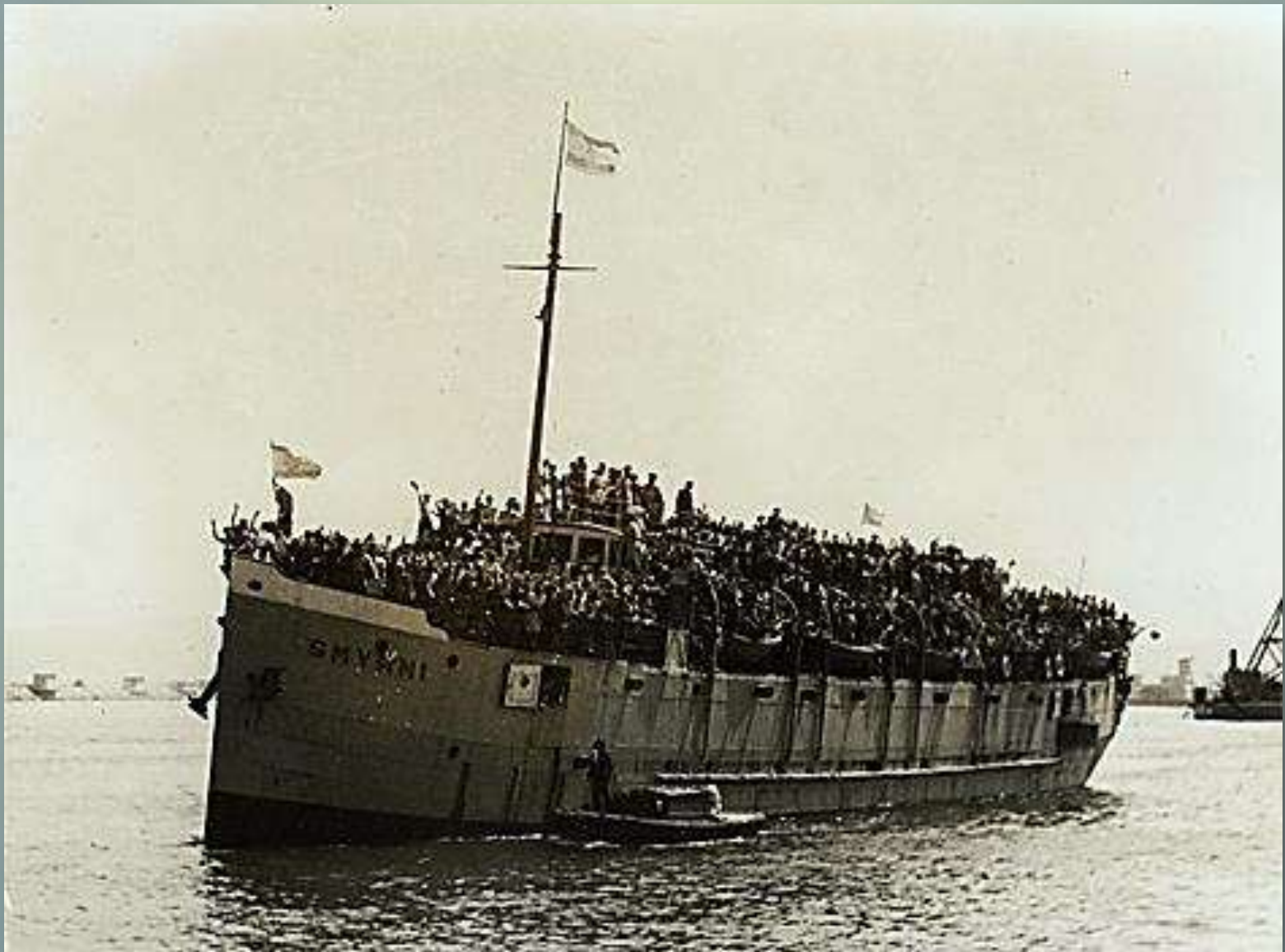
The role of the Bricha has been fulfilled!