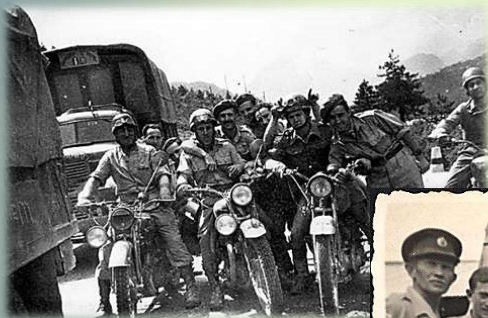
Jewish Brigade soldiers with Habricha trucks