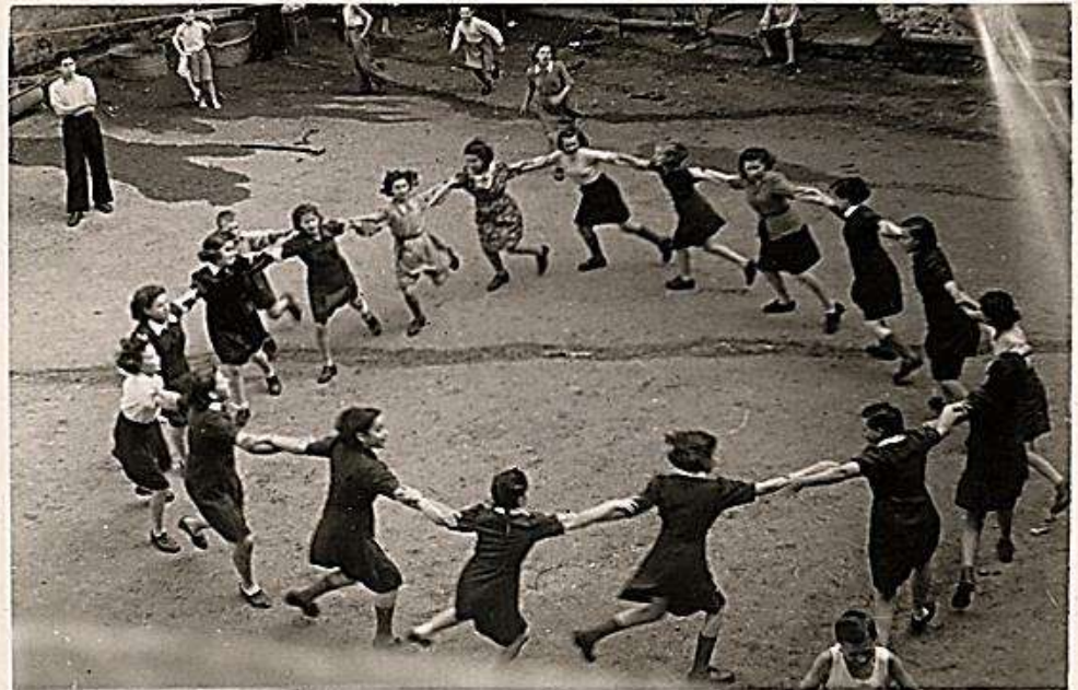
The home for child survivors in Langbilau, Klecko