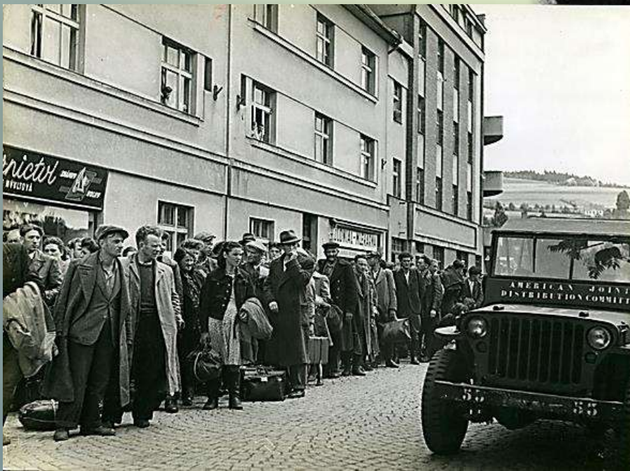
A group of refugees with a JDC jeep near the Czech border