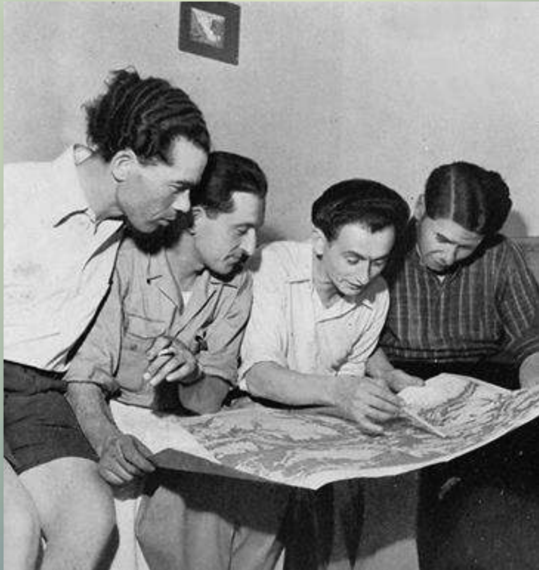
Habricha activists planning an escape route